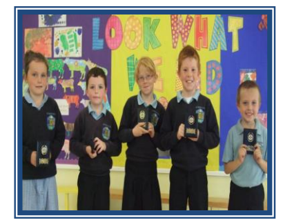
100% Attendance June 2011

15 children achieved 100% attendance for the school year. In the month of March the school had a focused target for full attendance.